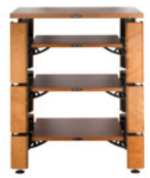
3-shelf-kit design example