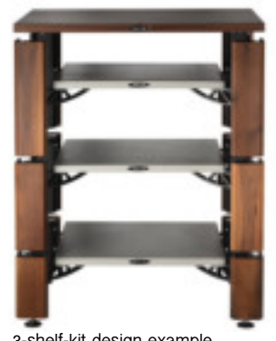
3-shelf-kit design example