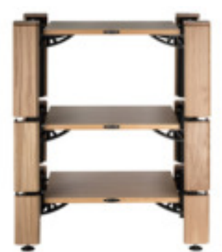
3-shelf-kit design example