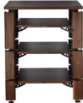
3-shelf-kit design example