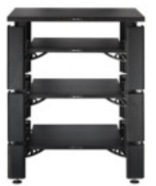
3-shelf-kit design example