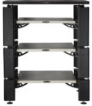
3-shelf-kit design example